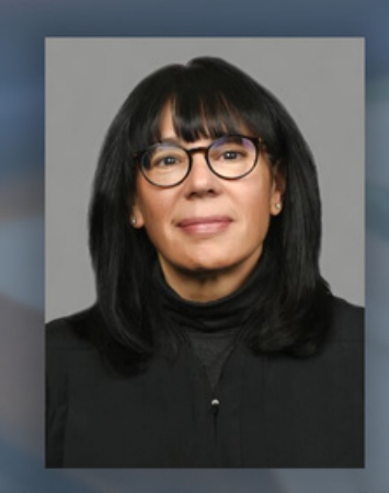
U.S. Magistrate Judge Elayna Youchah