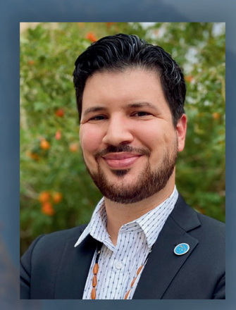
Chief Judge Kostan R. Loth<u>ouris</u>